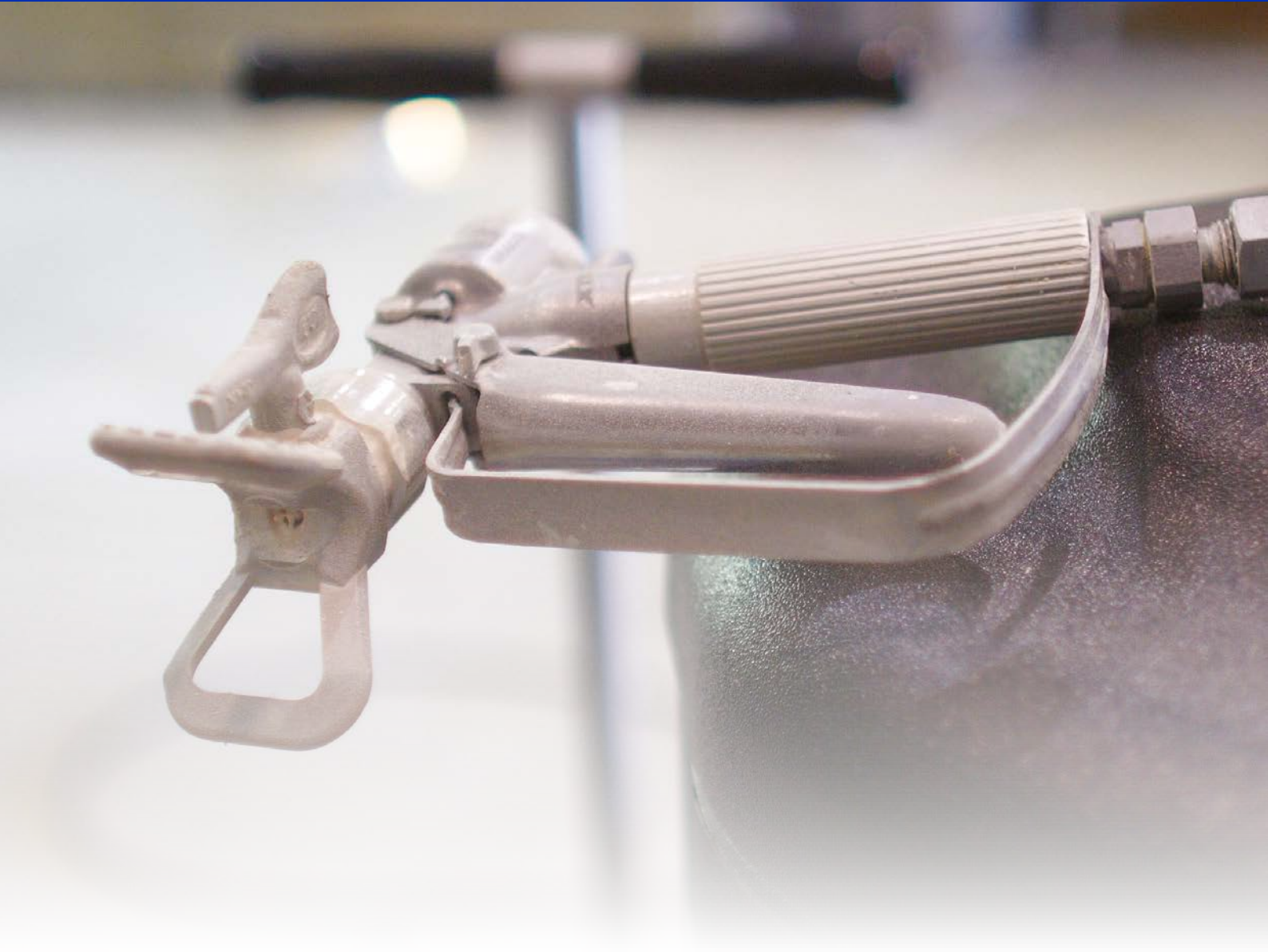
ORIFICE SIZE - MM (INCHES)